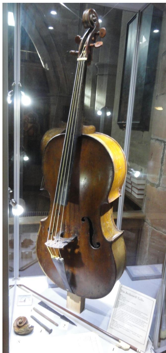
The Berkswell cello

In 2007 the Berkswell Museum committee was approached by Chris Egerton, a postgraduate student of stringed-instrument conservation at the Royal College of Art and the V&A. He prepared a Condition Report and treatment proposals, including photographs of its interior and suggestions for future display and interpretation. The cello was in a very fragile and unstable condition, with many missing parts and severe woodworm damage throughout. The committee decided on conservation and restoration to preserve the instrument for future generations, and it was restored to 'display' condition rather than playing condition, which would have compromised its many original 18 th -century features.