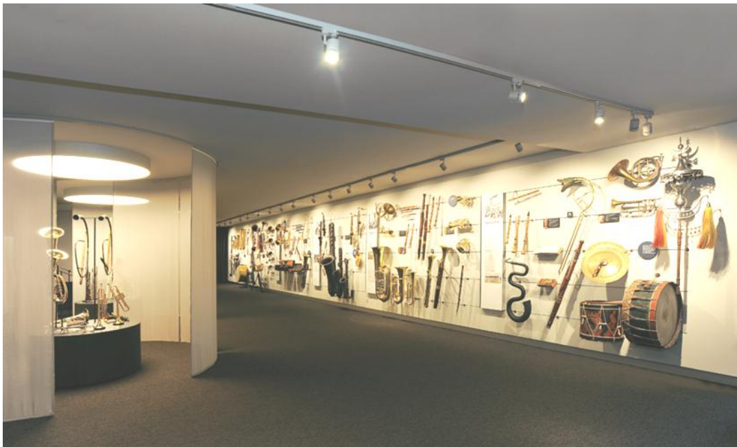
The new display at Bern Musical Museum (see p. 4)

CONTENTS: ::2:: Contacts; New members ::3:: Editorial; Journal errata; AGM notice ::4:: New display at Bern ::5:: SOAS Special Exhibition ::6:: Two Church Band Cellos ::8:: Trip to the Musical Museum, Brentford ::9:: Musical Instrument Resources Network ::10:: New publication by Panagiotis Pouloupoulos ::11:: Letters