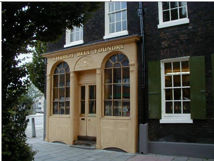
The Bell Foundry has been at its current site on Whitechapel Road since 1738