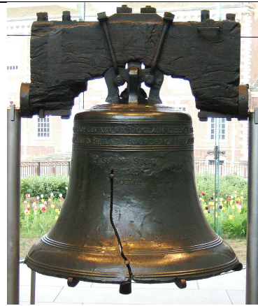
The Liberty Bell