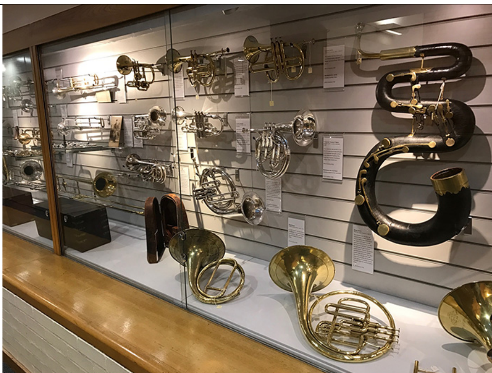
John Webb Collection of brasswind On display at the Royal Conservatoire of Scotland

CONTENTS: ::2:: Contacts; New Members ::3:: Editorial; ::4:: Brass exhibition at the Royal Conservatoire of Scotland, AGM Notice ::5:: Musical Instrument Resources Network ::6:: From the Archives ::9:: Whitechapel Bell Foundry ::10:: Mystery Instrument, Lisbet Torp ::11:: Centenary of Instruments at the Boston Museum of Fine Arts ::12:: Conference 2017