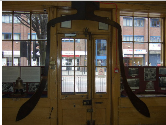
The template for Big Ben

Little more is currently known about the closure beyond the statement on the company's website , which states that it will honour all outstanding contracts but won't take any more on for the time being.