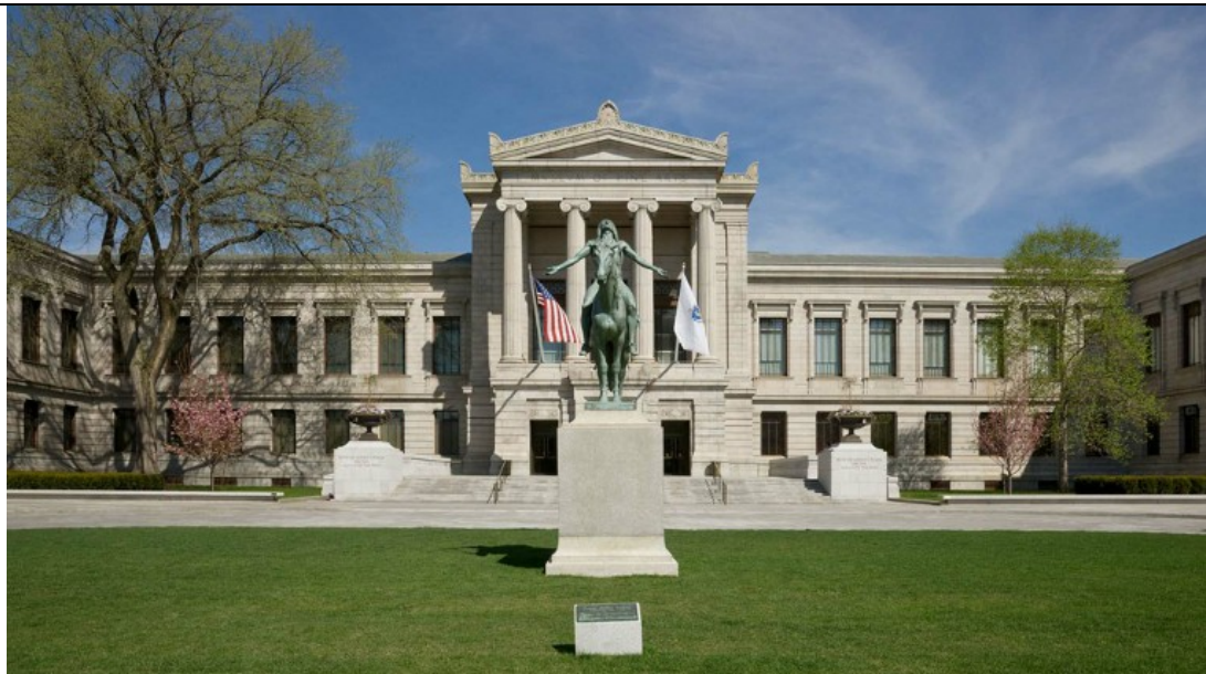
The Boston Museum of Fine Art