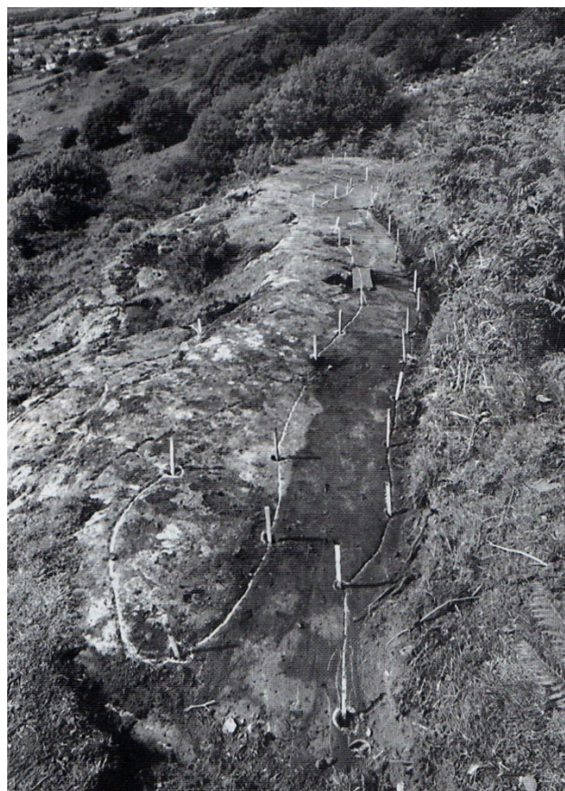
Right: Part of the Cae Ifan Gymro cannon of 153 holes, Llanllechid, Bethesda