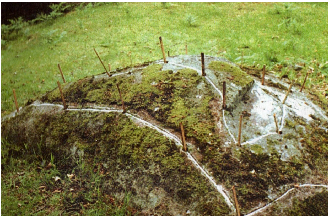
Welsh Rock Cannon (see p.11)

CONTENTS: ::2:: Contacts; New Members ::3:: Editorial ::4:: Christopher Hogwood Collection ::11:: Rock Cannon ::13:: Pamplin Award ::15:: Rubin/Nicholson Collection ::16:: Cambridge Conference