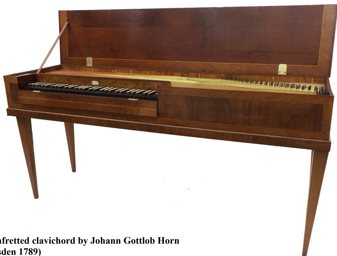
An unfretted clavichord by Johann Gottlob Horn (Dresden 1789)

Two clavichords represent the other great school of German clavichord building by the Dresden makers Johann Heinrich Gräbner and Johann Gottlob Horn. The latter is inscribed Nom 321, Johann Gottlob Horn, instrumentmacher in Dresden 1789 . Unlike the other relatively plain surviving clavichords of this maker the casework is a beautifully executed ensemble of veneering, crossbanding, and marquetry in mahogany, maple, yew, and boxwood that evokes some of the styling of early square pianos. The two soundholes hold handsome roses of layered pierced card in the style found on other Saxon keyboard instruments. It is unfretted with a compass of FF to g 3 , strung in brass with open wound strings from FF to A, and combines a particularly wide dynamic range with a sustained and singing timbre.