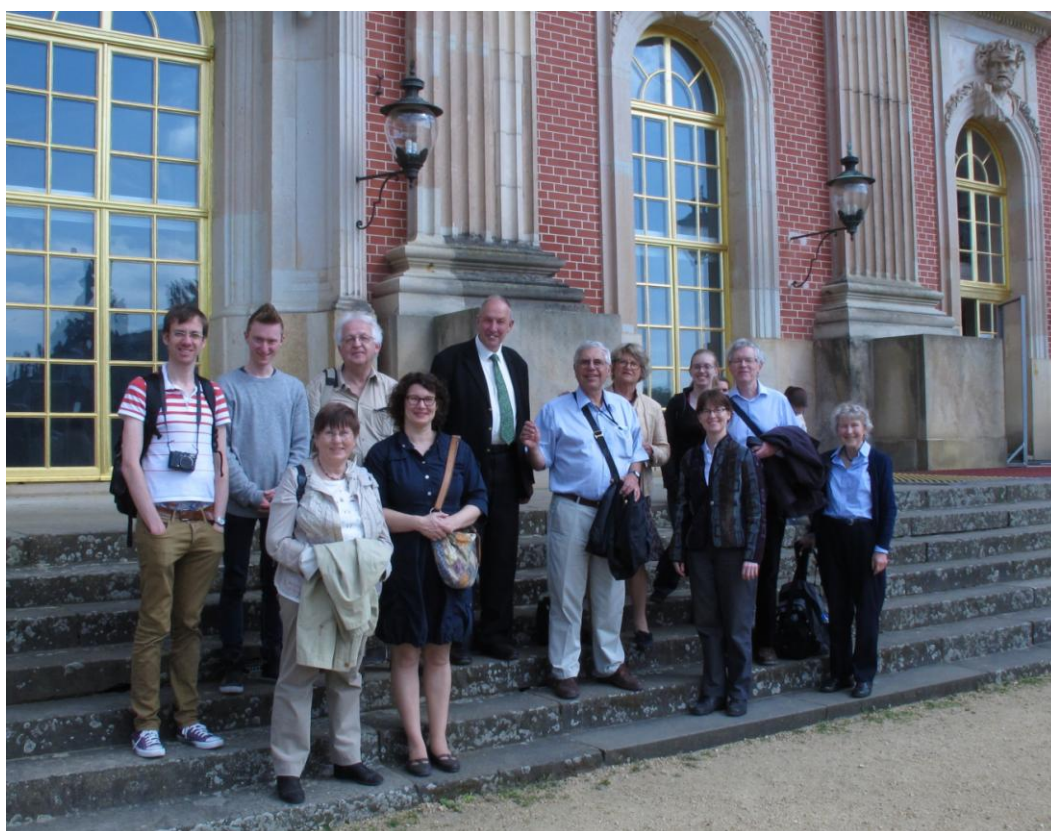
Neues Palais, Potsdam

CONTENTS: ::2:: Contacts; New Members ::3:: Editorial; Query ::4:: Deciphering Galpin ::7:: GS Visit to Berlin ::11:: Friends of Square Pianos ::12:: Forthcoming events ::13:: 2014 Ivory Trade & Movement Restrictions in the USA