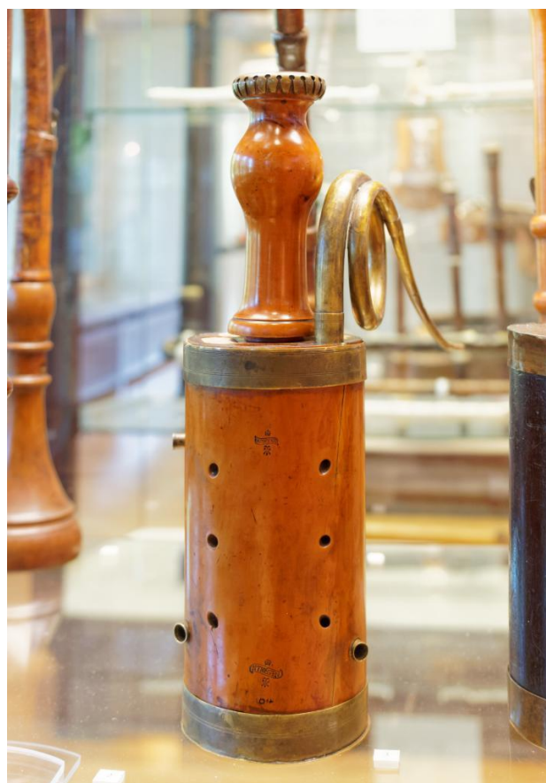
More treasures seen during the course of our travels! Top left: Grassi Museum, Leipzig; All others: Musikinstrumenten Museum Berlin