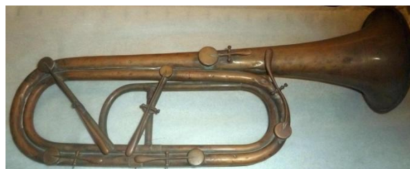
Keyed bass trumpet by Piatet & Benoit

While the importance of military music in warfare is powerfully emphasised, the museum also exists to represent the variety of musical activity in peacetime, both in earlier times and to the present day. Although welcoming to visitors, its principal function is to provide trainee musicians and student bandmasters with the historical context for today's operations and introduce them to a broader range of instruments. Instruments used over the past 200 years are well represented in the displays, and emphasise a continuing tradition. However, as is so often the case, much of interest is to be found among those items in any collection which are not organized and on display. It was therefore with a sense of keen anticipation that members were led into the cellars to view the reserve collection. This did not disappoint, and a number of fascinating items were discovered, in particular, a fine keyed bass trumpet by Piatet et Benoit.