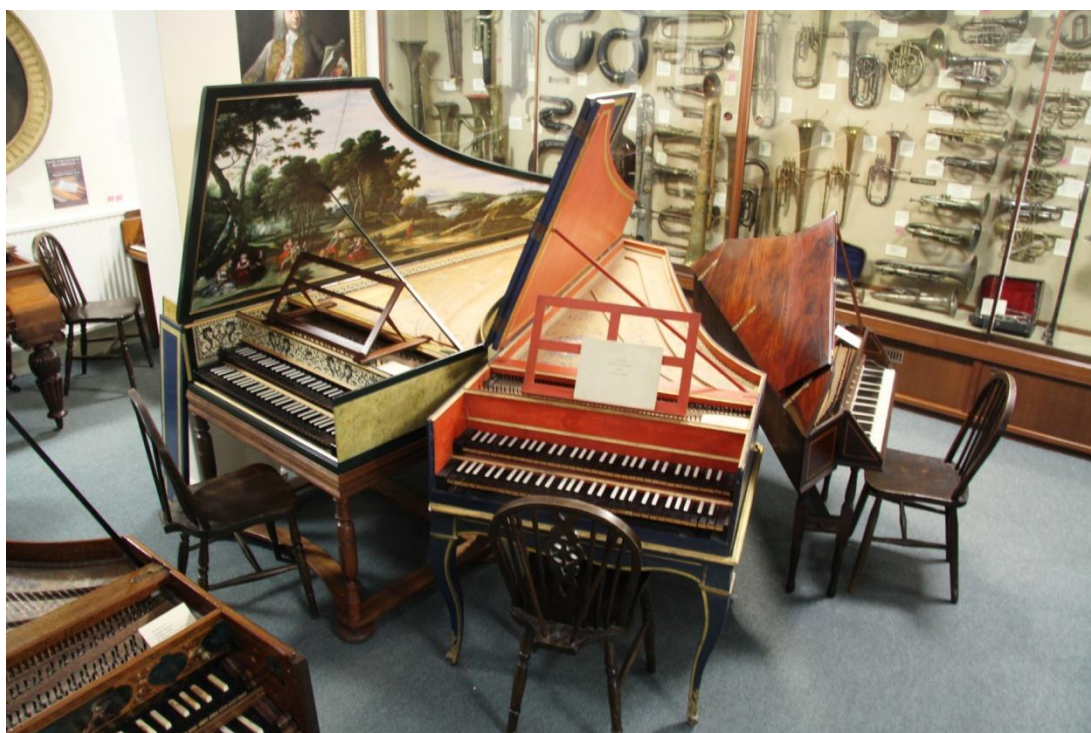
A corner of the Bate Collection, Oxford

CONTENTS: ::2:: Contacts, New Members ::3:: Editorial ::4:: Oxford Conference; Surprise Publication ::5:: Friends of Square Pianos ::6:: ANIMUSIC Conference; Rare Lute at Auction ::7:: Kneller Hall ::9:: Letters ::11:: Forthcoming Events