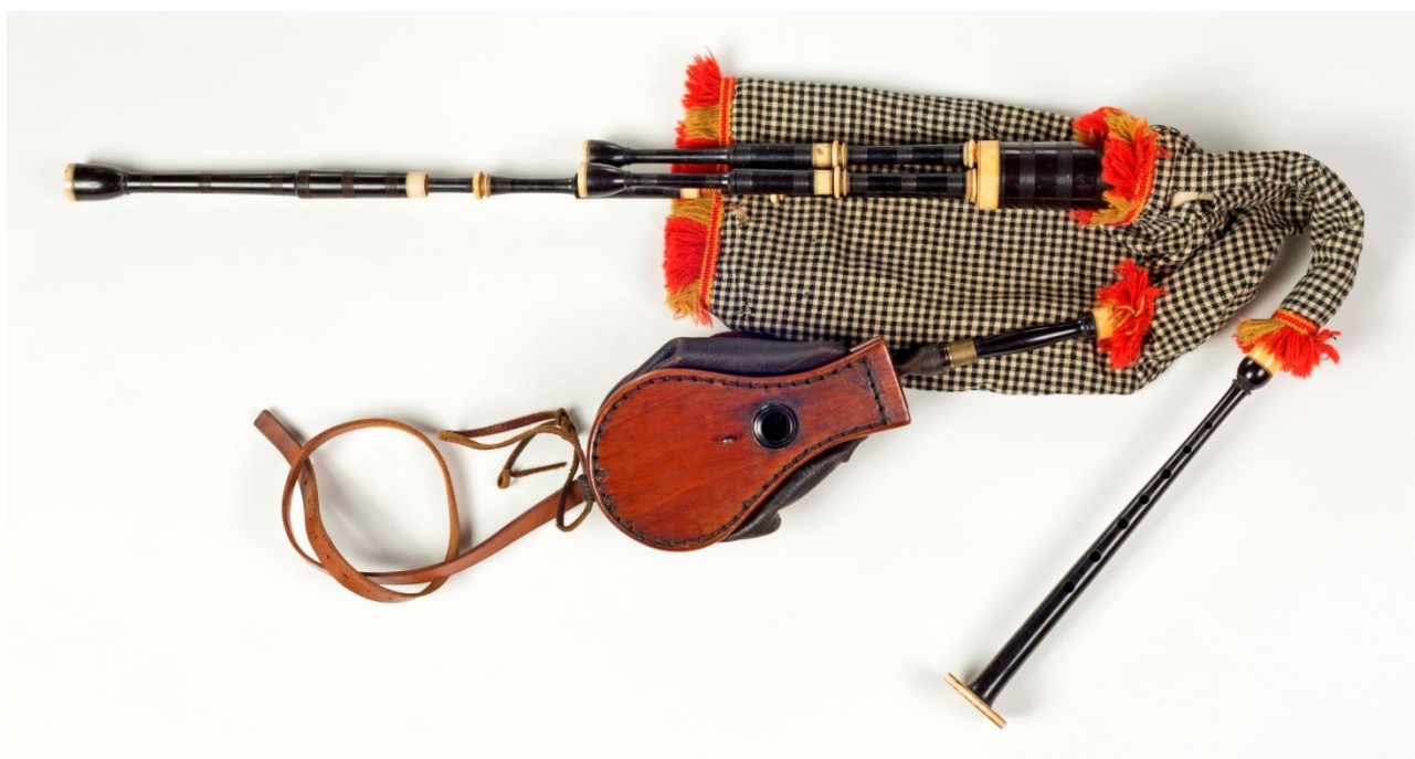
Set of Border bagpipes by George Walker, Edinburgh (c.1840), purchased by EUCHMI with the support of the Heritage Lottery Fund