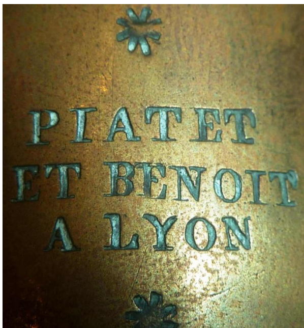
Detail of makers' mark on the keyed bass trumpet

Finally, we were given a brief tour of other notable parts of Kneller Hall such as the Officers' Mess dining room, used for special occasions. A surprise for most of us was the large chapel, built on the first floor in 1845-50, with fine stained glass windows and panelled walls engraved with the names of Commandants, Directors of Music, etc since 1857. It is used for Sunday services as well as for weddings where one partner is a serving or retired member of the British Armed Forces. The chapel also provides the students with the opportunity to practise and be assessed on their ability to arrange and perform music for church services.