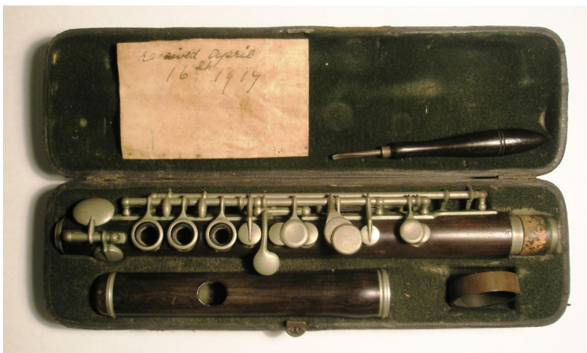
An anonymous early 20 th -century piccolo (see p.4)

CONTENTS: ::2:: Contacts, New Members ::3:: Editorial, 2013 Oxford Conference ::4:: An Early 20 th -century Piccolo ::6:: The Fortepiano in France ::9:: A 6-valved Cavalry Trombone ::10:: Further Research on Bressan ::12:: St Cecilia's Hall, Visit to Kneller Hall ::13:: Mystery Object ::14:: From our Members' Archives